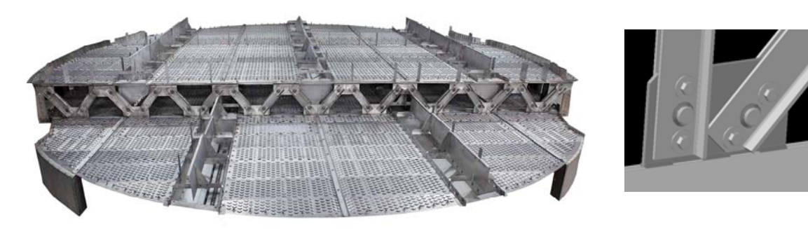
Figure 2: PINNED-TRUSS support structure

• PINNED-TRUSS support mechanism (Figure 2): This patented support structure was also developed to enable supporting devices in large diameter towers without negatively affecting the hydraulic performance. The support structure is split into many parts that can be passed through a manway. The pieces are bolted together inside the tower without welding being required. The load is transferred between the bolted pieces by large pins that are welded to one of the pieces. The bolts are simply holding the 2 together without having to transfer the load. The PINNED TRUSS can be pre-cambered to allow the trays to be flat and level under operating loads. The 6-pass SUPERFRAC trays used in case study 4.3 are shown supported by PINNED TRUSS support beams in Figure 2.