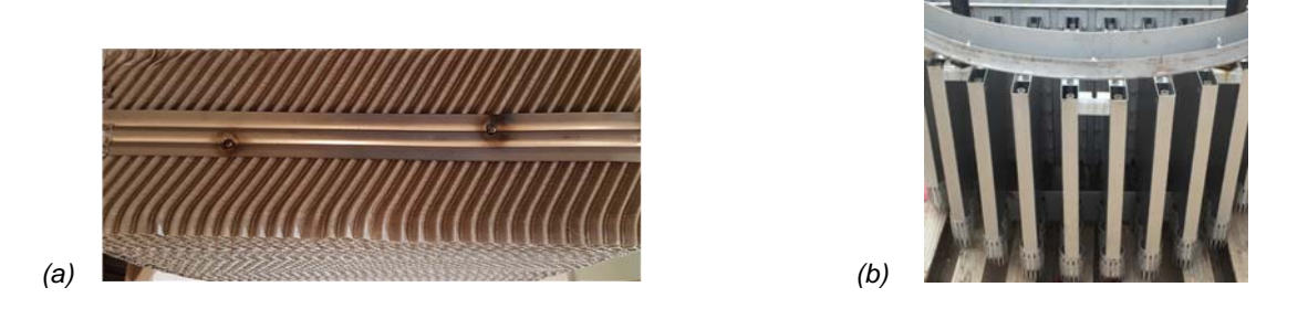
Figure 1 – Photographs of a segment of Montz-Pak A3-500M (a) and the liquid distributor used in this study (b), both courtesy of Dr. T. Cai of FRI

The packing tested was Montz-Pak A3-500M, an advanced version of common type corrugated sheet wire gauze packing, with unperforated surface and a smooth short bend at lower end of corrugations (see photo in Figure 1a). Nominal specific geometric area of this perforated wire gauze packing is 500 \text{ m}^2/\text{m}^3 , however based on measured corrugation dimensions of delivered packing the installed area is 478 \text{ m}^2/\text{m}^3 . The corrugation inclination angle is 60^\circ with respect to horizontal and the void fraction (porosity) of the dry packed bed is around 0.92 \text{ m}^3/\text{m}^3 . Packed bed comprised 13 layers of packing. Each layer consisted of four segments and was rotated by 90^\circ to the previous one, and the total installed bed height was 2.2 m.