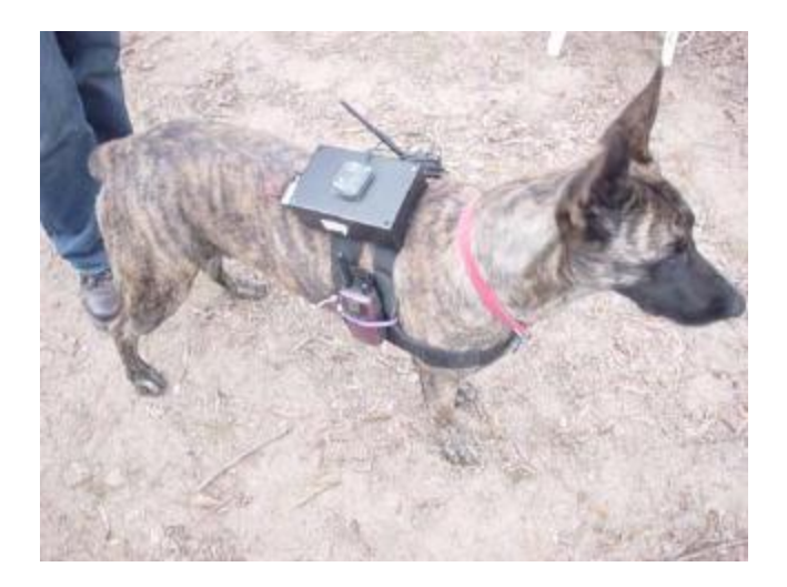
Figure 1. Remotely Commanded K-9 with Radio and GPS/INS Receiver

In later experiments, a GPS/INS radio in conjunction with an IMU, Magnetometer, and Accelerometer located on the K-9 unit (shown in Figure 1) wirelessly communicated to a laptop data on acceleration, velocity, latitude, longitude, and heading. This information was recorded as the dog was commanded by a human trainer from a start position to a known goal. Each time, the path was in the same general area (an open field), but the paths were not the same (differing start locations and destinations). The pathways were fairly straight and had only limited obstacles (changes in elevation, holes in the ground, etc.) A corresponding tone ("on" for normal or "off" for anomaly) that was being produced by the trainer was recorded alongside the GPS/INS data. An example trial is shown in Figure 2, where the x-marks represent the dog going off path and