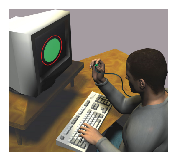
Fig. 3. Experimental setup. The subject sits in front of a monitor, holding a 3D absolute position sensor (Polhemus Liberty). Here n_h=2,\,n_s=1. The center-stationary green circle is the target, whose diameter (\boldsymbol{s}(t)) fluctuates according to damped Brownian motion, and there is a concentric 'cursor' (red circle) whose diameter is z(t) = m(t)^T h(t) , with m(t) fluctuating according to an independent damped Brownian motion. The subject is then told to move however possible to try to keep z(t) = s(t). Trials are 1 min., started by a key-press and sampling rate is 50Hz.

subjects, as shown in Fig. 2(a), were able to track the target. When the map's velocity changed or for some other reason they lost the map, they exhibited sudden large exploratory movements and then tracked for another period of time. Often both the model and human exhibited exploratory movements at similar times.