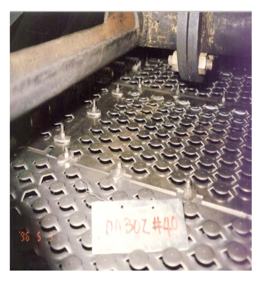
Glitsch High-Performance Anti-Fouling Tray, SUPERFLUX® "After one year in operation"

Fouled Valve Tray Before Revamp "Pop-corn Polymer"