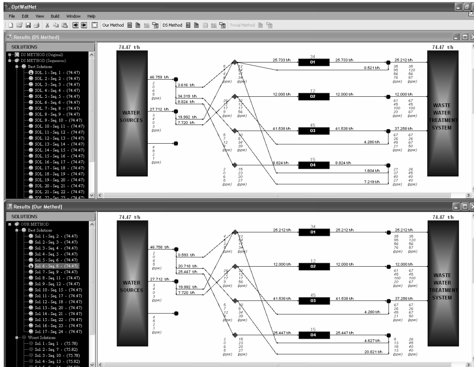
Figure 3. Comparison of degenerate solutions with different structures