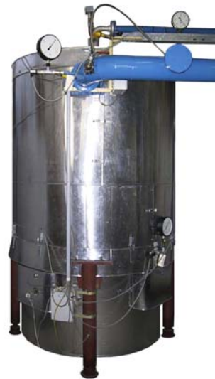
Figure 1 Compact equipment

There are no pipelines needed for connection of combustion chamber, catalytic