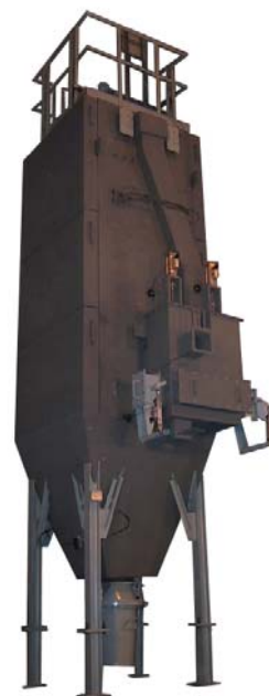
Figure 3 Equipment filtration/adsorption (SCR)

Filter contains 15 filter bags with a diameter of 152 mm and is 2,500 mm long. Two replaceable modules are on the each side of the filter. These modules can be adapted for adsorption process of waste gas, or for storage of a catalyst for selective catalytic reduction NO_x (SCR). Area of adsorption layer is 3.5\text{ m}^2 and high of the layer is 0.25 m. The last part of the experimental equipment is so-called drive unit, which will supply transport of waste gas and pressure gas for pulse-jet regeneration of filter bags. This module also contains adsorbent injection system (especially for sodium bicarbonate), and can also be further equipped with a liquid injection system (injection of NH_2\text{-X} compounds).